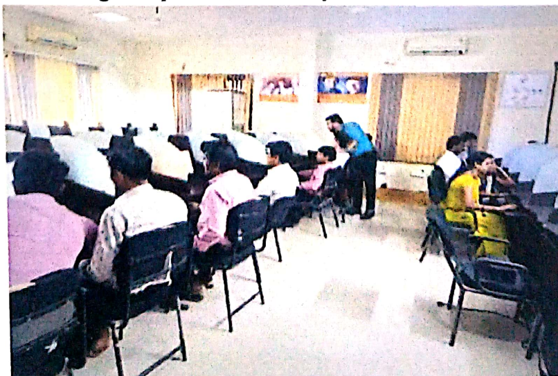
MS office training programme for Non-teaching staff

IQAC cell of Vidarbha Institute of Technology College with the Department of Mechanical Engineering had successfully organized workshop for the non-teaching staff of the college. The First workshop titled, 'MS-Office training program for 2 days' was held on 18/09/18-19/09/18. The second workshop titled, The prime participants of this workshop were employees from the administrative department, accounts section and the library. The objective of the workshop, which was to establish a degree of comfort for performing day-to-day activities using computers, was very well achieved.